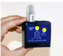
OxSim™ SpO2 Simulator