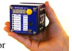
SimCube™ NIBP Simulator

Combine SimSlim with SimCube and OxSim , save money and take your test bench with you wherever you go.